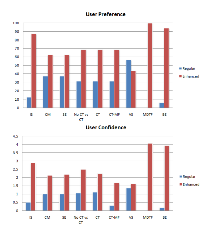
Fig. 3. In these graphs, we shows the results of all the enhancement techniques that we evaluated. The top graph shows user preference and bottom graph shows user confidence for the visualization technique (enhanced vs regular). Here, IS = Image space saturation, CM = Colormap modulation, SE = specular exponent modulation, No CT vs CT = Std. lighting vs Cook-Torrance lighting model, CT = Modulating the result of Cook-Torrance lighting only the microfacet term in the Cook-Torrance model, VS = Vicinity shading, MDTF = Multidimensional transfer functions and BE = Boundary enhancement. MDTF, BE and IS were the most preferred. (higher preference and higher user confidence).

We have presented a novel technique that monitors the ambient illumination on the display in the operating room and modifies the displayed visualization in real-time based on changes in the illumination settings. The visualization parameters are varied based on the light settings to generate illumination-appropriate enhanced visualizations that convey depth and structure effectively. Results of a user evaluation found that subjects preferred multidimensional transfer