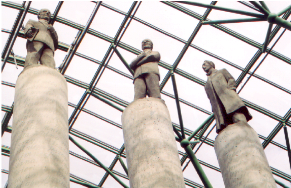
Figure 1: The logicians among the four philosophers, Lukasiewicz, Tarski, and Lesniewski.

During the Alfred Tarski Centenary Conference (Warsaw, May–June 2001), I visited the new emerald library of the University of Warsaw and stood amazed below the truly monumental statues of four Lvov-Warsaw School philosophers: Twardowski, Lukasiewicz, Tarski, and Lesniewski. The last three are also renowned as mathematical logicians. Only in Poland do they elevate their philosophers—and then not on pedestals, but on eleven-meter inscribed columns at the head of a four-meter staircase! [11]